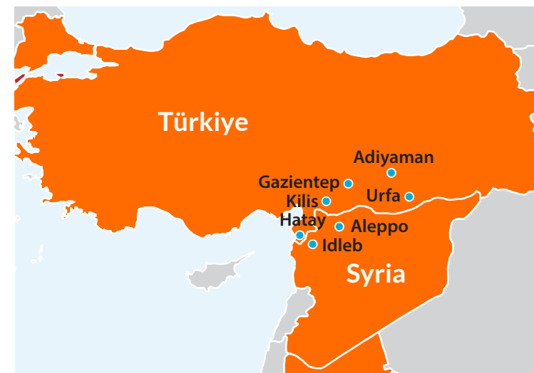
Map of World Vision Syria Response countries – showing where WVSR is responding

On March 20, the international community met in Brussels to collect funds for post-earthquake support in Türkiye and Syria. Together, they raised EUR7 billion in grants and loans, of which EUR 911 million was collected in grants for Syria, in addition to EUR1.7 billion in grants and EUR4.3 billion in loans for Türkiye. 1 Overall, the appeal for Syria before the earthquake was only 6% funded, whereas the flash appeal for earthquake relief was 95% funded. 2